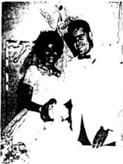
August 29, 1968 The Voice-Jeffersonian